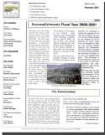
San Jacinto's Annual Report of Accomplishments

San Jacinto Municipal Museum The Museum exhibits were redesigned to better tell the story of San Jacinto's rich history. Two modern lighted display cases were donated by the San Jacinto Museum Association for the exhibits. The public is invited to visit the Museum at 181 East Main Street on Thursday through Saturday afternoons from 12:00 p.m. to 5:00 p.m.