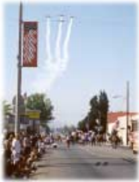
Aero Club Flyover

at the Estudillo Mansion continued the day's festivities, with live entertainment, food vendors, games, clowns, and parade awards. An enjoyable afternoon was had by all.