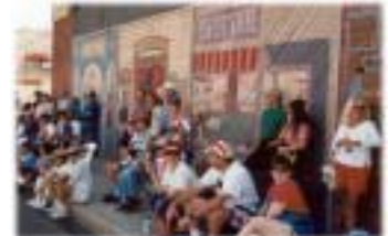
4th of July Parade