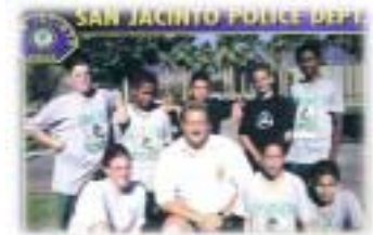
School Resource Officer

In the City's ongoing efforts to be prepared for future crises, an Emergency Operation Center (EOC) has been implemented to respond to and manage disasters. In cooperation with the San Jacinto Unified School District, an EOC command post will be set up at 2045 South San Jacinto Street (behind the school district offices) to address disasters as they arise.