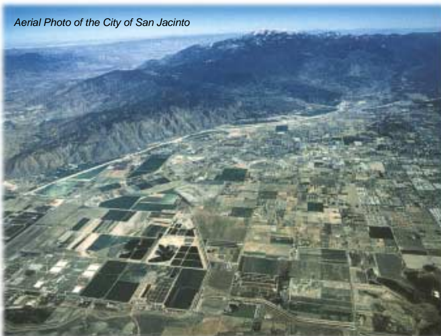
Aerial Photo of the City of San Jacinto