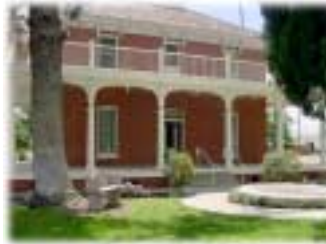
Estudillo Mansion Reconstruction of the Porch & Balcony

San Jacinto was honored to have the Estudillo Mansion listed on the National Register of Historic Places and on the California Register of Historical Resources. Placement on the National Register affords a property the honor of inclusion in the Nation's official list of cultural resources worthy of preservation. In addition, the City received a $50,000 matching grant from the State Office of Historic Preservation to begin rehabilitation of the first floor of the Mansion. The Estudillo Restoration Association provided $30,000 toward the required match and the remaining funds came from the City.