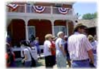
4th of July Celebration at the Estudillo Mansion

After the tragic events of September 11, 2001, the cities of San Jacinto and Hemet and Valley Wide Recreation and Park District, held a Candle Light Vigil to remember those who lost their lives, provide hope to the many rescue workers, volunteers, and community members, and give encouragement to all Americans.