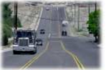
Lake Park Drive Rehabilitation