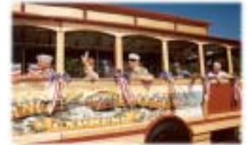
4th of July Parade

The Mansion received a face-lift with the reconstruction of the porch and balcony. To facilitate access to the porch, a handicap accessible ramp was installed. Wrought iron fencing was also constructed around the property.