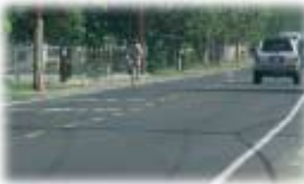
Lyon Avenue Pavement Rehabilitation

During Fiscal Year 2001-2002 approximately $3,097,000 of the City's Measure "A", Community Development Block Grants, Redevelopment, and Flood Control Funds were utilized in the planning and construction of the following capital improvement projects: