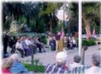
Veterans Memorial Ceremony