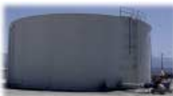
Bath Reservoir Interior Recoating