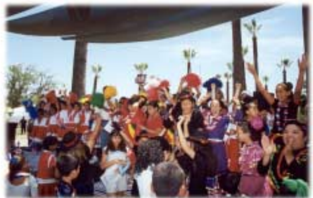
4th of July Celebration at the Estudillo Mansion

San Jacinto has a rich heritage and during the past year City Council and staff worked to preserve this heritage, while taking advantage of new opportunities. In the following pages, you will find highlights of community events like the 4 th of July Parade and Celebration, progress on the historic Estudillo Mansion, street improvement projects, updates from City departments, and