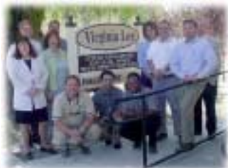
Community Development Staff

The Community Development Department, comprised of Planning, Building and Safety, Code Enforcement, Redevelopment, GIS/ Graphics, and Economic Development had a very busy year due to increased development activity throughout the City.