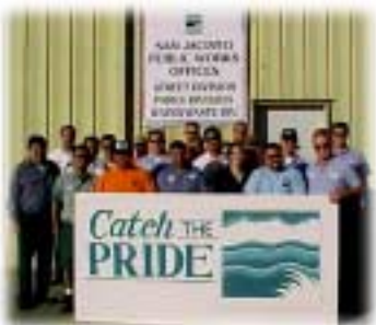
Public Works Staff

Water supplies to meet the needs of our growing region has become a major issue in recent years. Aquifers that supply much of the ground water to serve our community are at historic lows and more demands are placed on the Valley's ground water system every day.