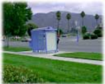
State Street Sidewalks